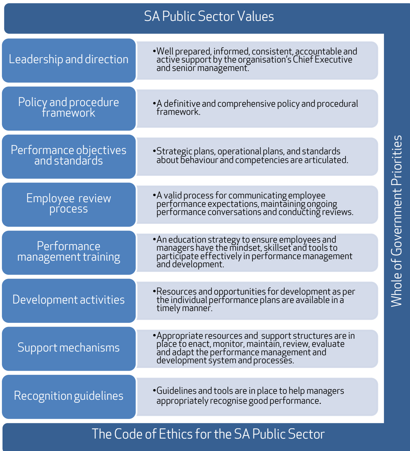
Figure 2. Public Sector Performance Management and Development System