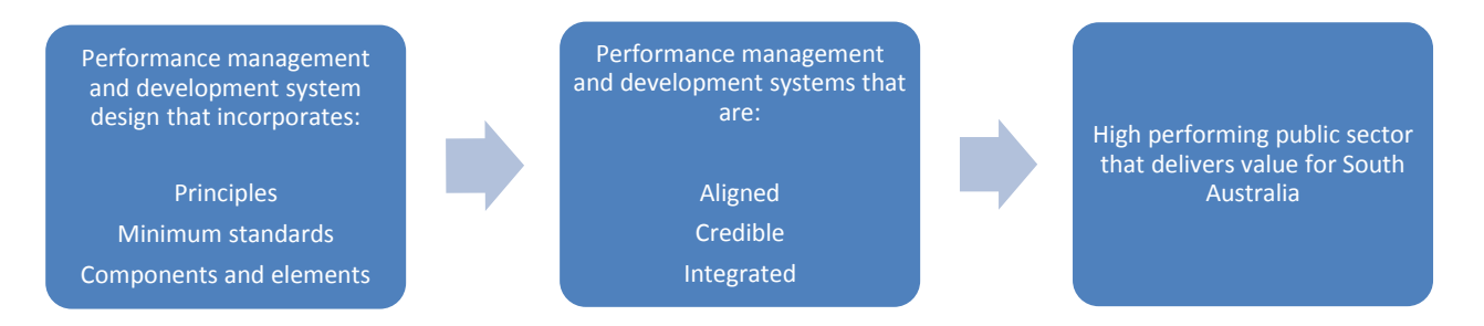
Figure 1. Designing performance management and development approaches that deliver value for South Australia